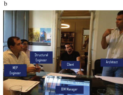
Fig. 2. (a) Façade Design Options during Schematic Design; (b) Collaborative Meetings during the Design Development.