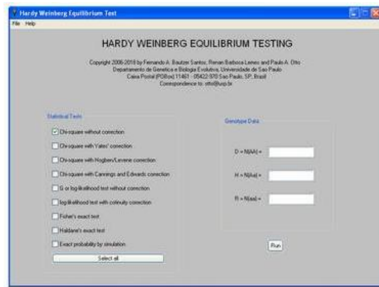
Figure 2 - Prompting window for choosing options and entering genotype data in the two-allele case.

If the number 2 is entered (two-allele case), the user is prompted with the window shown in Figure 2. The text that follows corresponds to this case. The generalized case of n alleles will be dealt with at the end of this section, with the corresponding text identified by the caption (2) THE GENERALIZED CASE OF k ALLELES.