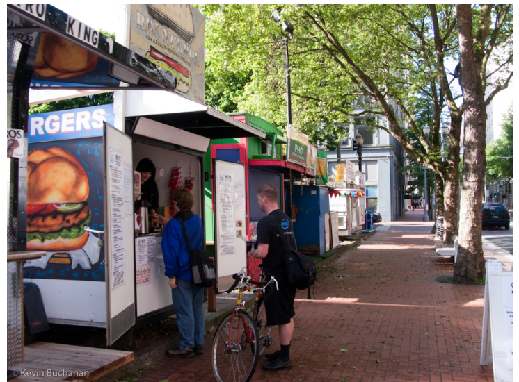
Food carts in Portland, OR

From Los Angeles to Miami, smart cities not only lower the barriers to entry, but also nurture such businesses, as they they contribute to the city's local economy and enhance its sense of place.