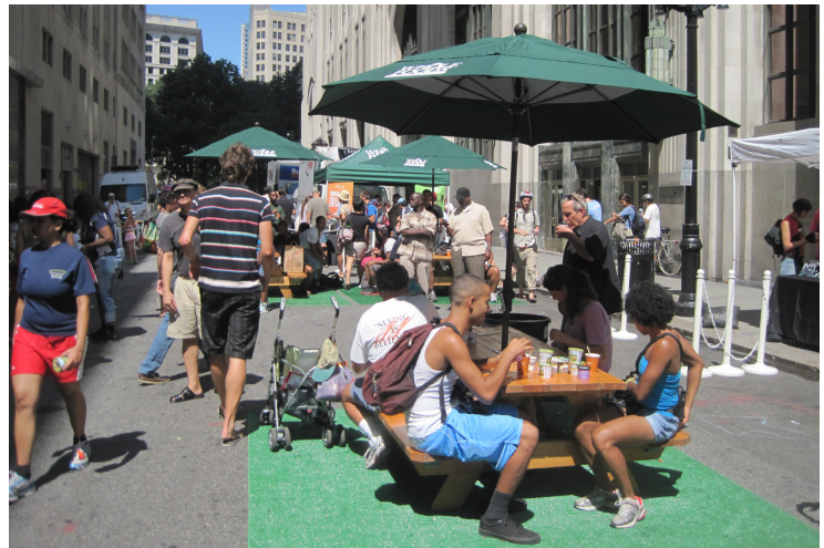
Street fairs help bring communities together in the public realm.