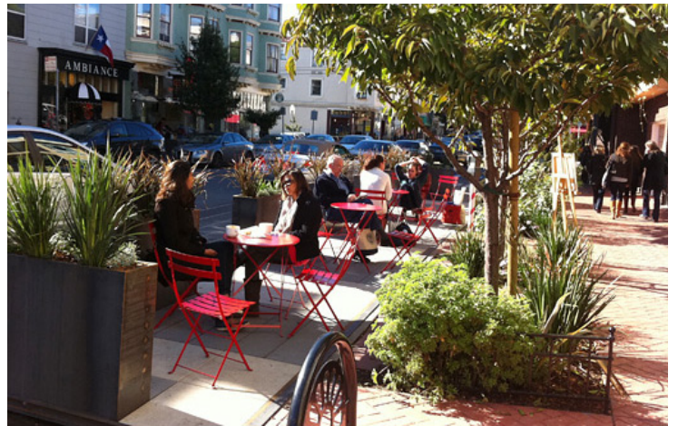
San Francisco's Pavement to Parks.