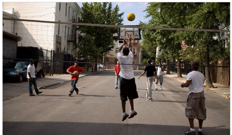
Play streets provide playgrounds where they don't currently exist.