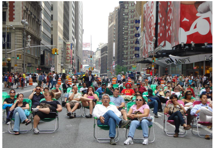
Phase 1 of the new Times Square simply added lawnchairs.

By taking this experimental, "lighter, quicker, cheaper," approach, the City and public-at-large are able to test the performance of each new plaza without using up scarce public resources. If successful, the intervention can then transition into a more permanent design and construction phase, as is happening currently in several of New York City's new plazas and sustainable street "pilot" projects.