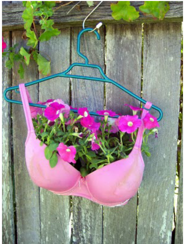
Guerilla Gardening offers an outlet for creative energy.

Guerilla gardening is an excellent tactic for instantly improve an urban neighborhood. Often times, gardens are cared for years after they are first created, illegally. Indeed, the first garden started in a vacant New York City lot by the Green Guerilla's became so loved that it is now maintained by volunteers and the New York City Parks Department. This exemplifies how tactical urbanism is intended to work.