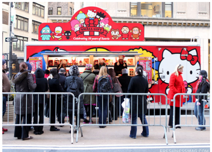
A Pop-Up Shop