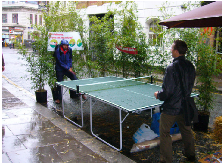
Rain or shine, PARK(ing) Day brings creativity to city streets.

While participating individuals and organizations operate independently, they do follow a set of established guidelines. Newcomers can pick up the PARK(ing) Day Manifesto , which covers the basic principles and includes a how-to implementation guide.