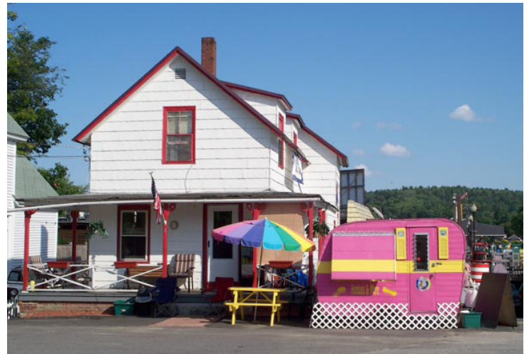
Food carts offer low start-up costs for any entrepreneur.