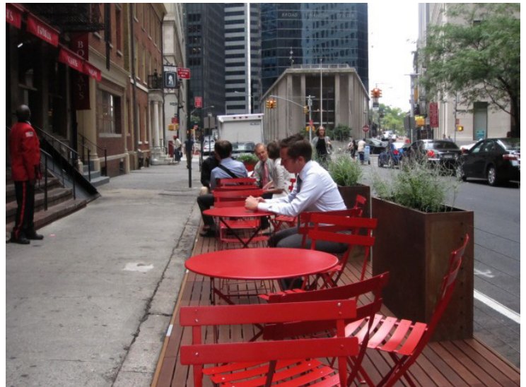
Trading parking space for outdoor seating that can be used by restaurant patrons or passersby is a win-win.