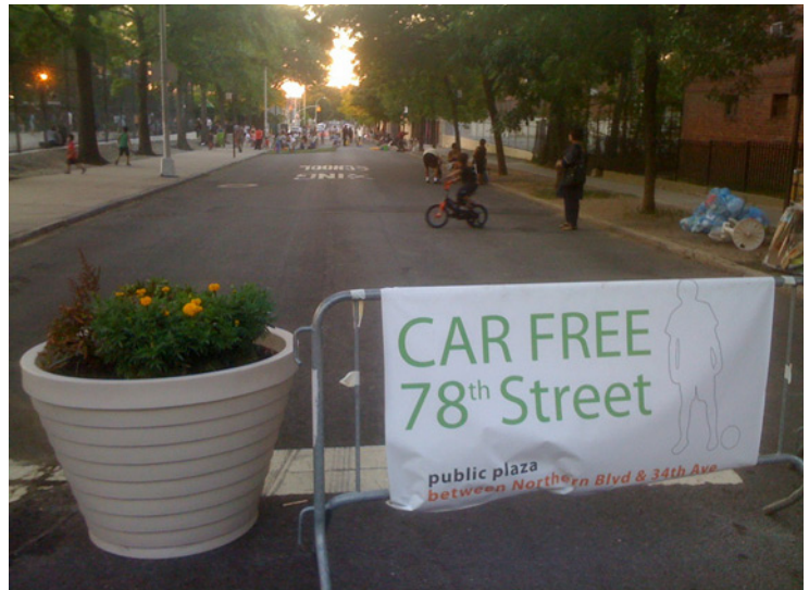
Car free space provides carefree play space.