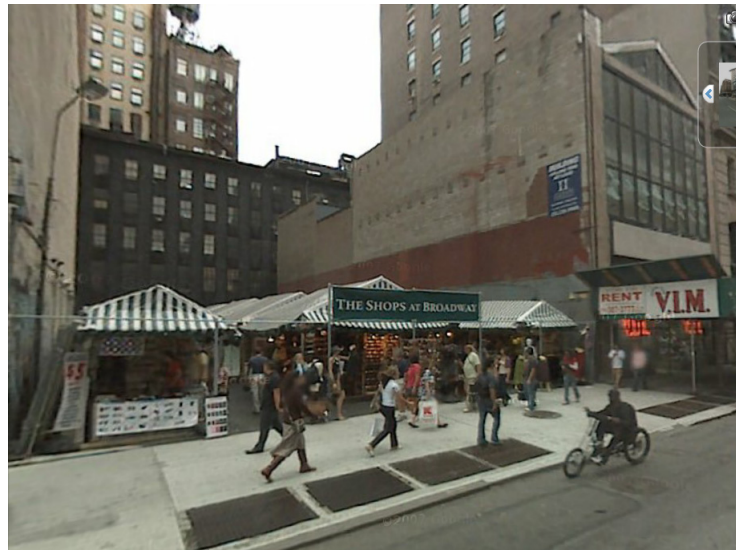
Pop-up tent-based retail helps activate this vacant lot.

More than just marketing ploys for large retail corporations, pop-up stores genuinely bring vitality and help businesses transition to permanent spaces.