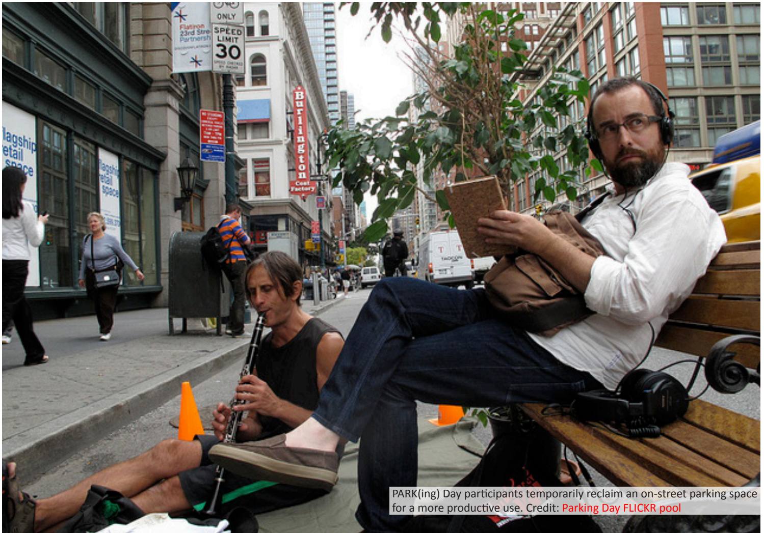
PARK(ing) Day participants temporarily reclaim an on-street parking space for a more productive use.