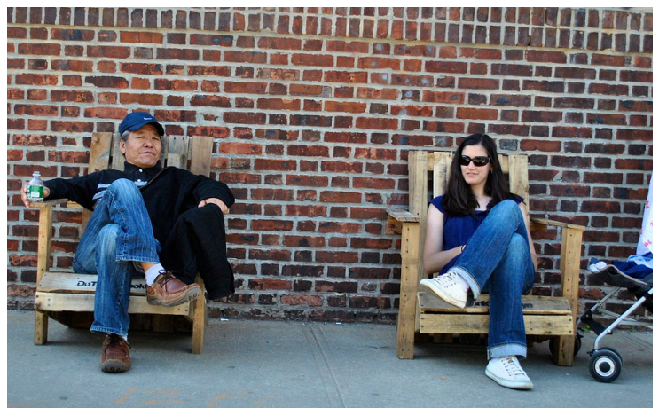
Step 3: Place chairs where needed.