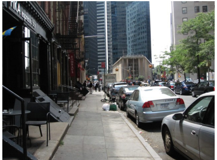
A narrow sidewalk limits the possibility of outdoor seating.

In city's with a short supply of space and a need for more publicly accessible seating, pop-up café's are fast becoming a valued addition to the public realm. If successful, they can also prove the need for permanently expanding city sidewalks.