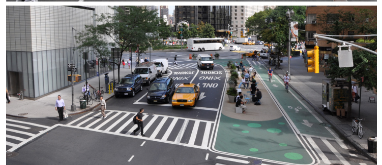
NYC's Greenlight for Broadway provides more space for people.