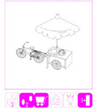
Above and below: Mobile vending continues to increase in popularity.