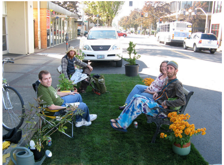
A simple PARK(ing) Day installation.