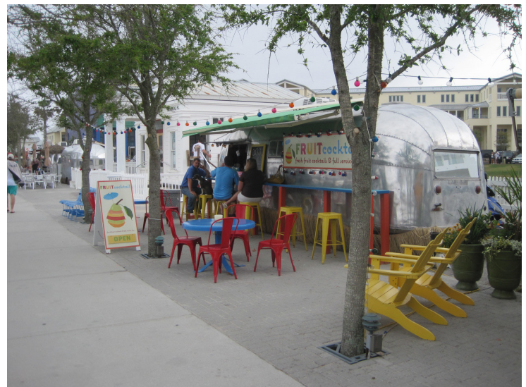
Food carts line Seaside, FL's central square.