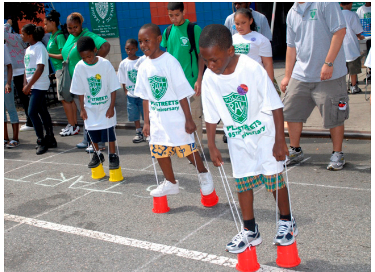
Play streets give kids space to move.

In New York City, a 'play street' is made possible when 51% of the residents living on a one-way residential block sign a petition and offer it to their local police and transportation officials, who then send it to the local community board for review. Once the community board approves the idea, the initiative can take shape and the city provides youth workers to supervise the program. Approximately 75% of these initiatives are organized by the New York City Police Athletic League.