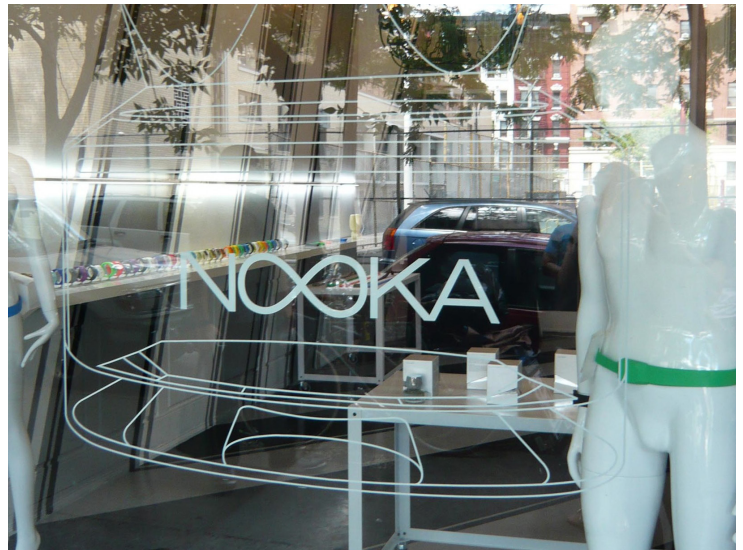
A Pop-Up Shop