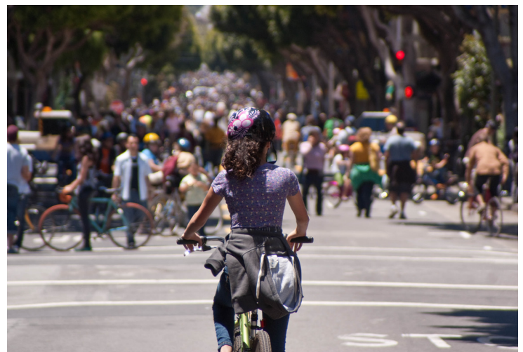
San Francisco's Sunday Streets