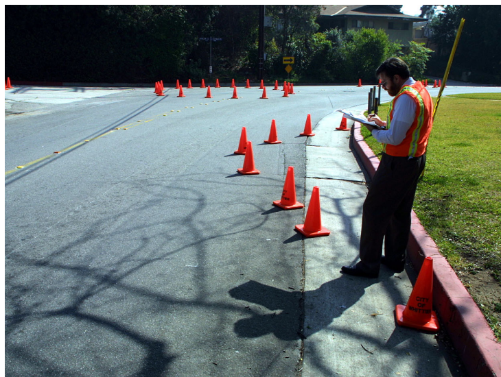
Temporary experiments can test physical improvements prior to implementation.

If included as part of a public charrette process, some examples of tactical urbanism may more quickly build trust amongst disparate interest groups and community leaders. Indeed, if the public is able to physically participate in the improvement of the city, no matter how small the effort, there is an increased likelihood of gaining public support for larger scale change later. Additionally, involving the public in the physical testing of ideas can yield unique insights into the expectations of future users and the types of design features for which they yearn; truly participatory planning must go beyond drawing on flip charts and maps.