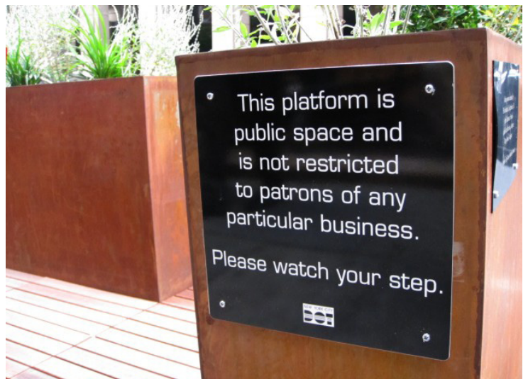
New York City now sanctions what used to be done by advocates.