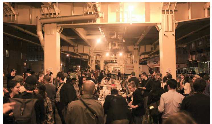
A group of non-profit and neighborhood organizations hosted a 2011 PARK(ing) Day after party below the Brooklyn-Queens Expressway.