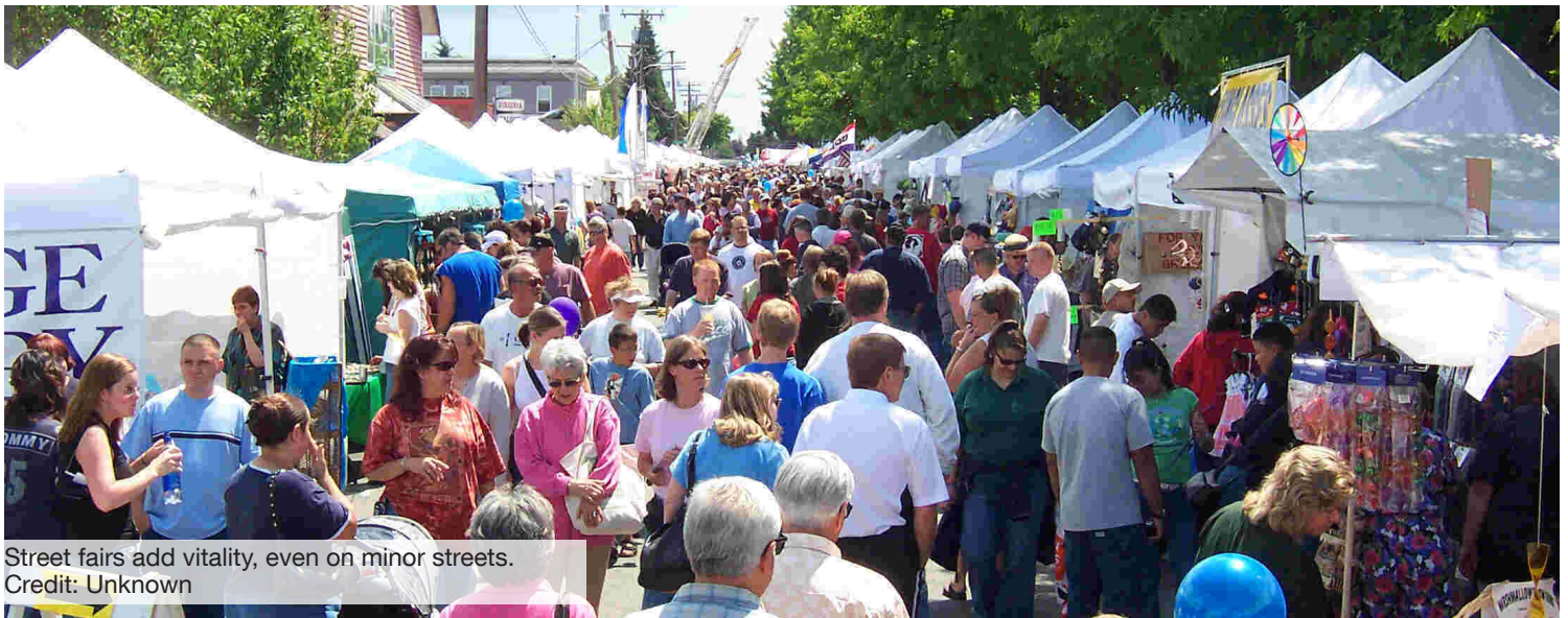
Street fairs add vitality, even on minor streets.