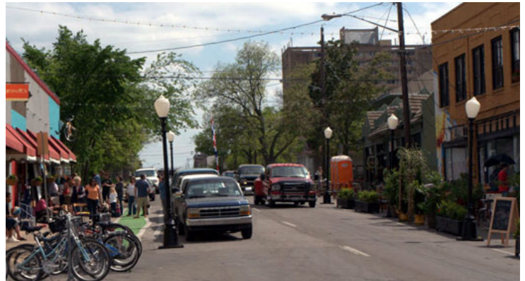
Before and after: Dallas Build a Better Block