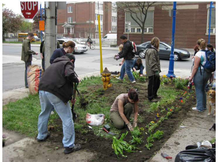
Green Guerillas at work.