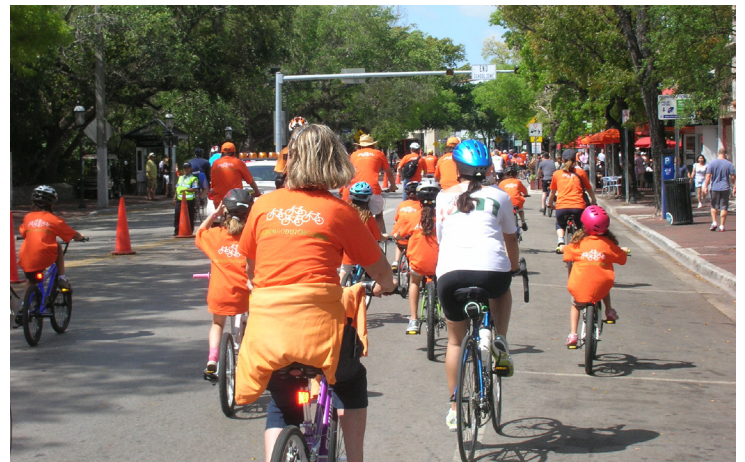
Bike Miami Days