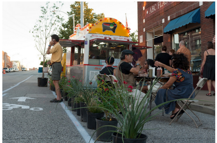
Fort Worth, TX Build a Better Block.

country. Indeed, similar efforts have now taken place in Fort Worth, TX, Oyster Bay, NY, Oklahoma City, OK, and Memphis, TN where 15,000 participants helped reinvigorate a stretch of Broad Avenue.