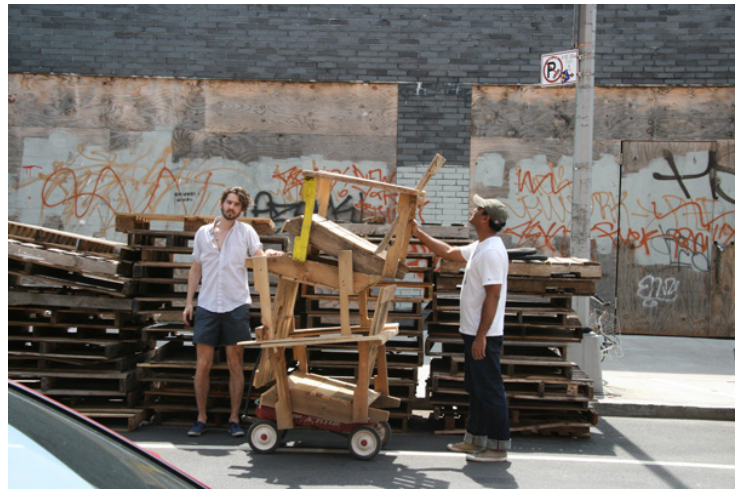
Step 1: Collect used shipping pallets.

Whether to rest, socialize, or to simply watch the world go by, increasing the supply of seating almost always makes a street, and by extension, a neighborhood, more livable.