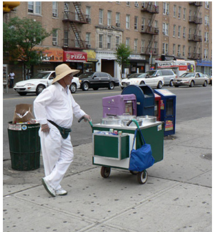
A New York City Street Vendor

According to Shinohara, vendors play a key role in animating the various spaces of a city. This “Custom Bike Urbanism [...]” suggests a possibility of constructing urban spaces that are individualistic and dispersed, yet able to accommodate a multitude of dynamic forms. With the inherent characteristics of mobility and ephemerality, it brings vibrancy to redundant urban space and enhances the function of the existing city.”