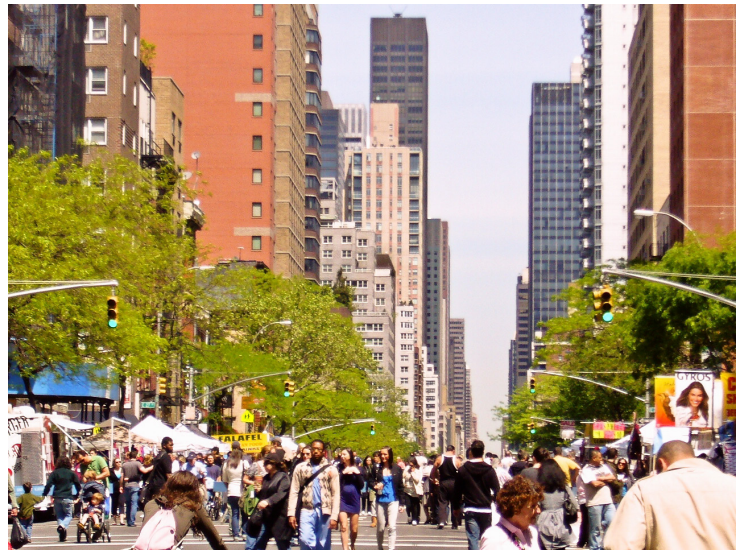
One of New York City's many street fairs.

Street Fairs are the type of event where people become familiar with each others skills and learn what their community has to offer. Often, street fairs take place within a community's main street, or at larger sites, such as the village green or a centrally located plaza. This can raise the visibility of the city's premier public space and offer entertainment to citizens of all ages: many well-programmed street fairs feature musical performances, art exhibitions, interactive entertainment, and local food vendors. Street fairs can also provide the opportunity for communities to organize political support for local improvement initiatives.