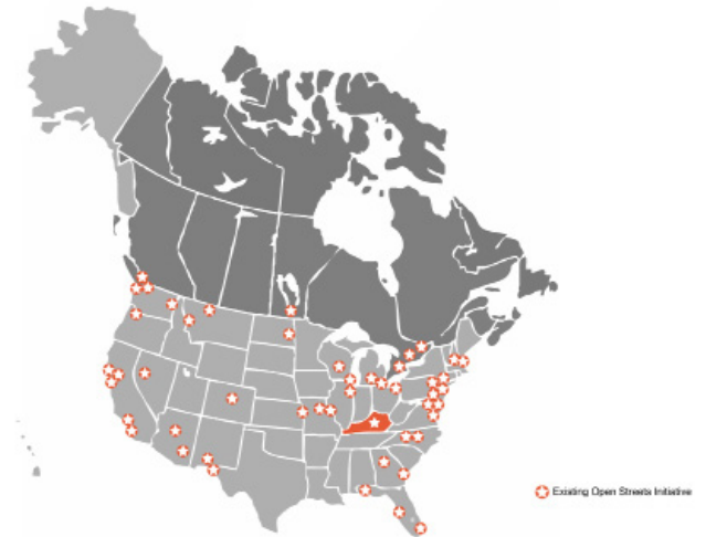
North America's Open Streets Initiatives.